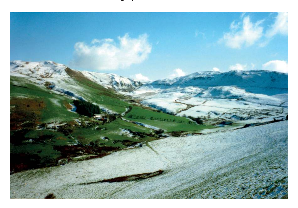
Photograph D for Question 2