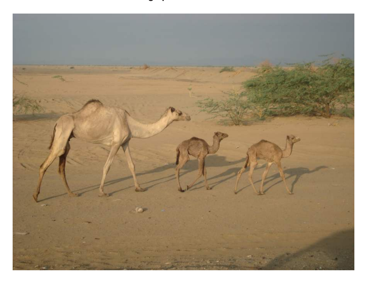
Photograph B for Question 1