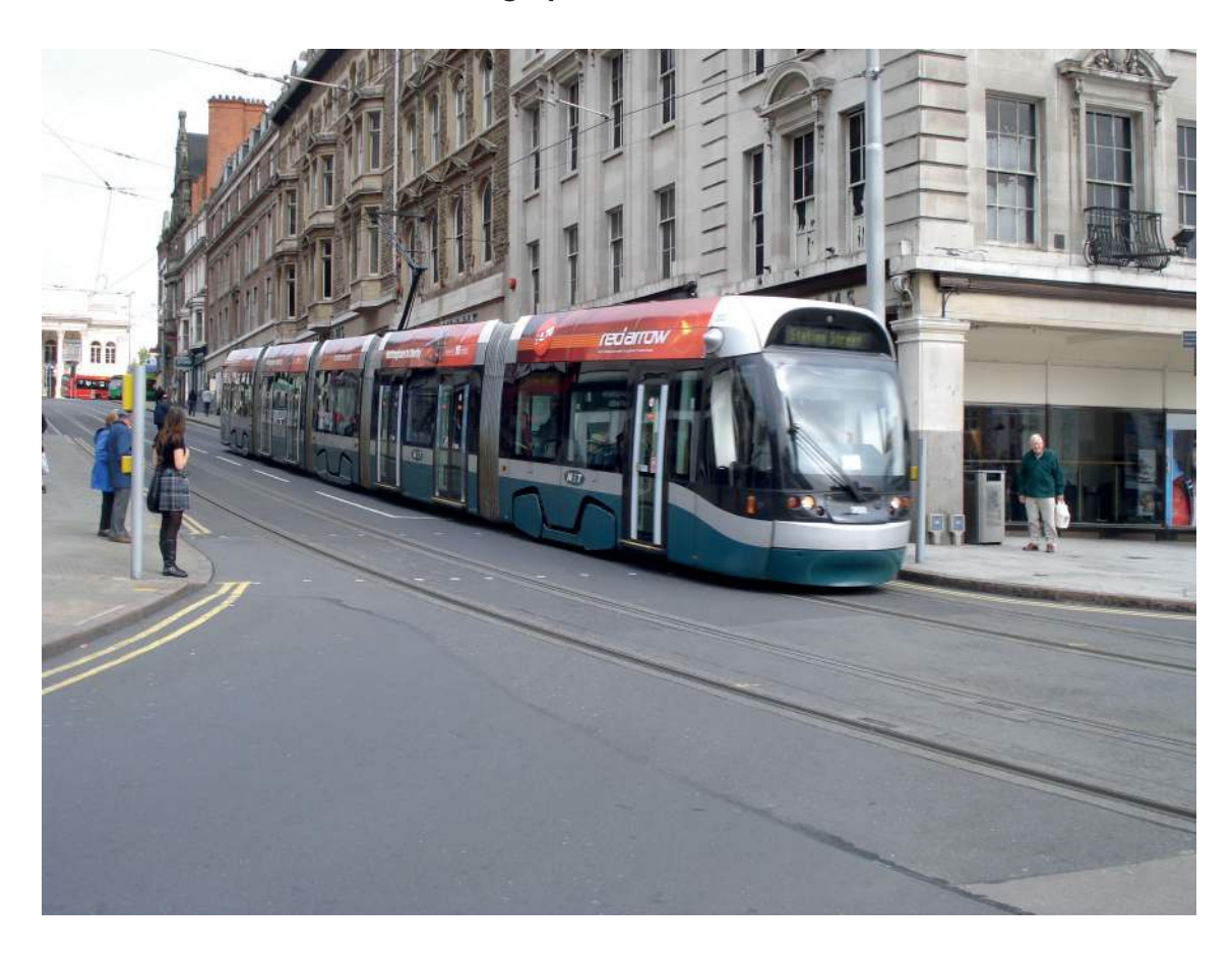
Photograph F for Question 3